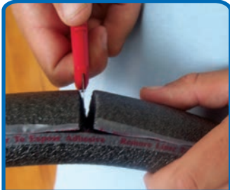
STEP 1 Using a craft knife cut Bison® Pipe Insulation to required length.