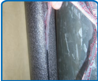
STEP 3 Remove the two strips of liner to expose adhesive.