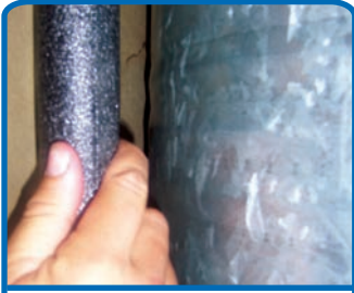
STEP 4 Gently push together Bison® Pipe Insulation to securely join.