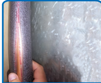
STEP 2 Fit Bison® Pipe Insulation around pipe.