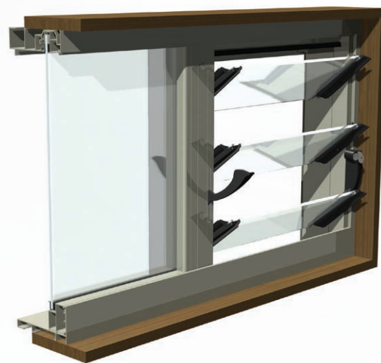
Altair™ Easyscreen Window System with picture window