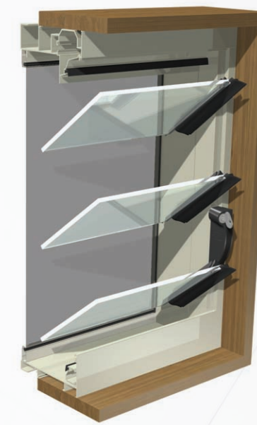
Altair™ Easyscreen Window System with keylock