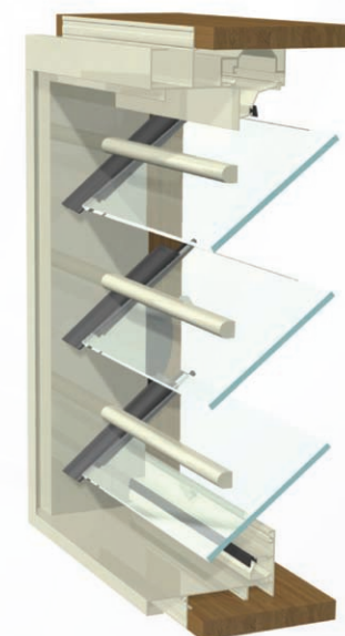
Altair™ Easyscreen Window System with security bars

*Note Altair™ Louvres can also be fitted into vinyl, wood and other aluminium surround frames if required. Contact your local Breezway Authorized Reseller for more information.